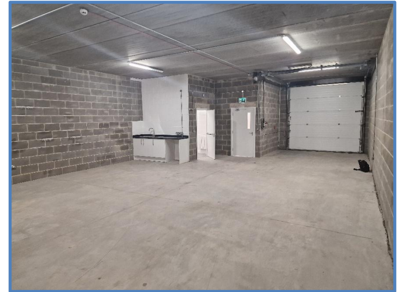
The internal images seen are from number 12 Crossings Court